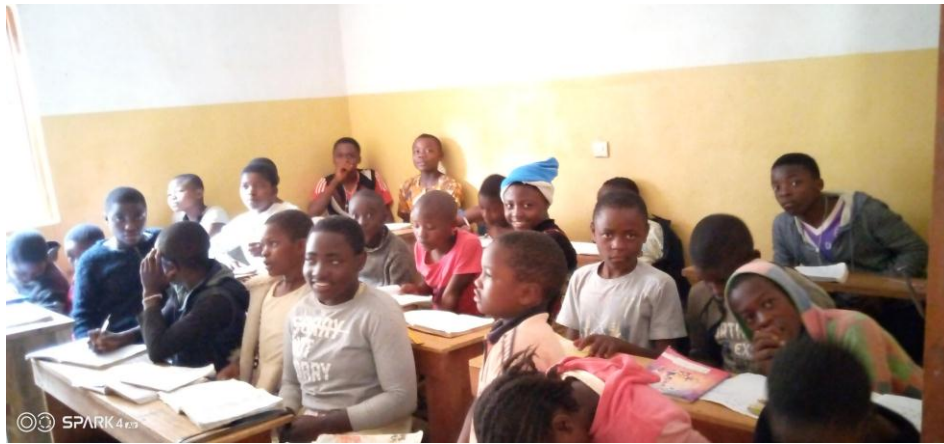
The Primary School at Akum

The primary school is moving fine. The children from the community around join the children in the center for studies. The enrolment of the school is 150 pupils including the children of the center. The classes are from Nursery one to Primary six. We also have some girls attending secondary school out from the center.