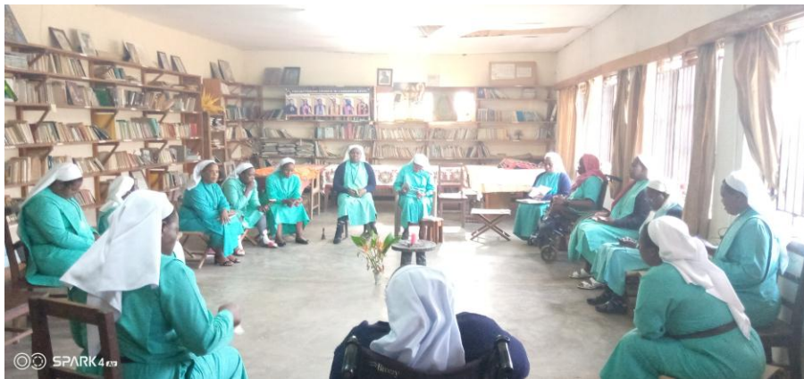
Consecrated sisters for annual meeting 26/12/2020

Important to note also that no matter how busy and occupied we are, the core of our life which is prayer is maintained. In the different places where we leave we maintain our prayer life even if we have to adjust the prayer time table to fit the various programs of these different places.