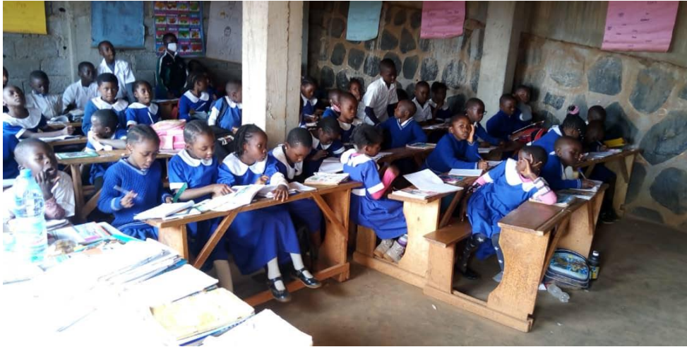
Primary school pupils in their class