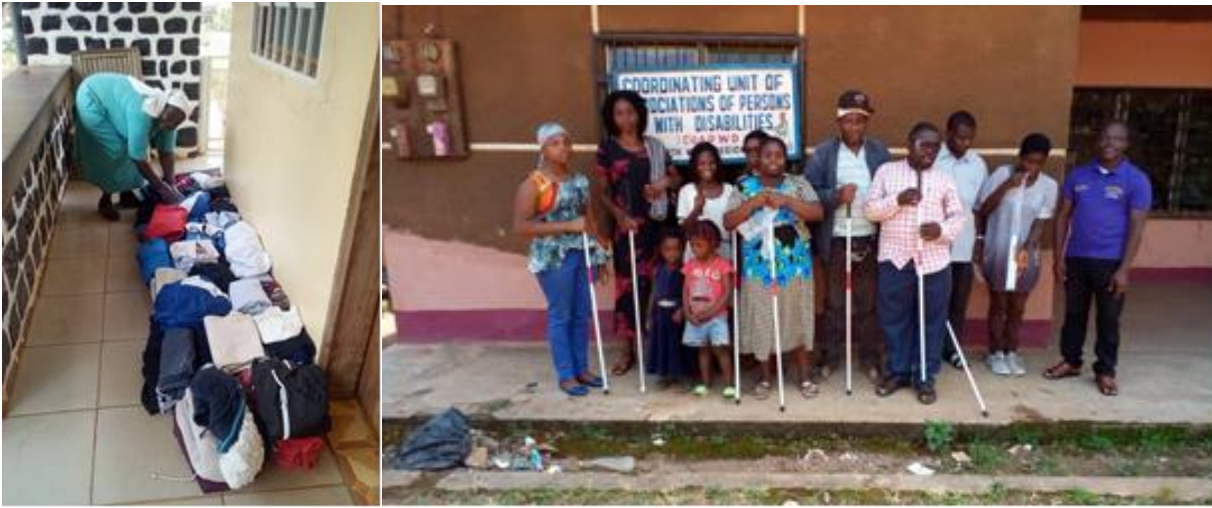
Dresses, assistive devices especially white canes were amongst the articles made available to persons living with disabilities in 2020.