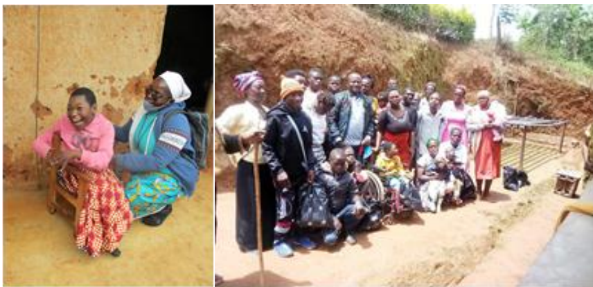
Shearing love in the field was also amongst the issues noted by our team

Towards the close of the year the Agape Unity team in a grand event at the Nseh Fons palace joined the international community to commemorate the international Day of persons living with disabilities. This occasion presented an opportunity for persons with disabilities to socialize with the highest authority in the community – the fon and to listen to different health talks from health specialist.