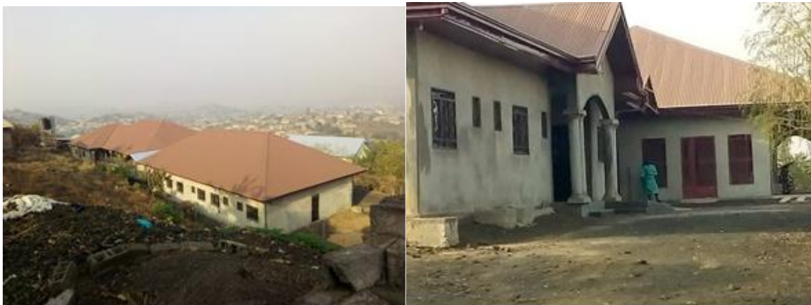
The back and front view of our new house at Foubot

Thank you for helping us realize the house in Foubot. We now have the extension building which has gone far. We are grateful to also announce the realization of a bore hole in Foubot which have solved the problem of water to us and the neighborhood.